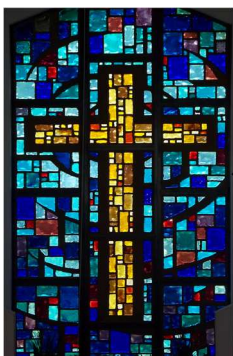
By the Cross We Care One Person at a Time