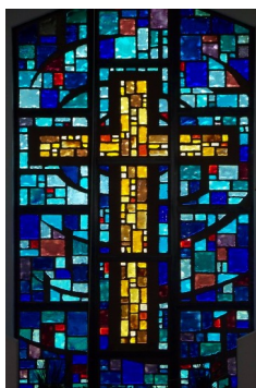
By the Cross We Care One Person at a Time