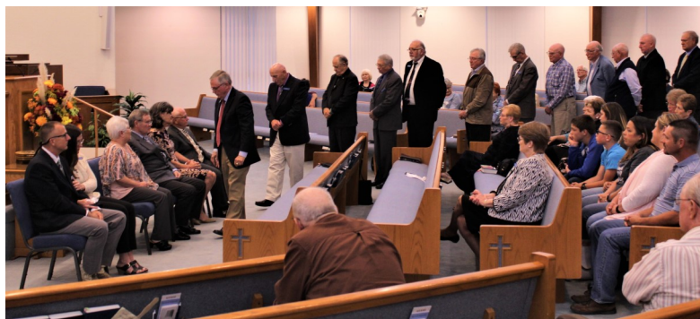
ORDAINED DEACONS LAYING ON HANDS OF NEWLY ELECTED DEACONS