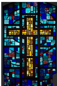
By the Cross We Care