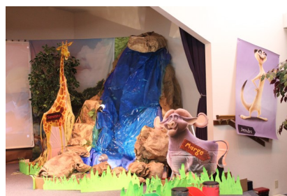
Our jungle scene