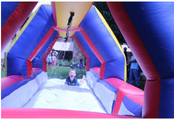
Fun on Registration Day