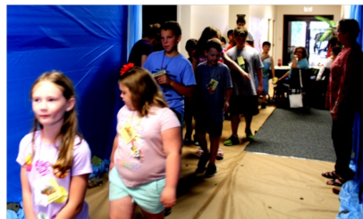
Parting the Red Sea