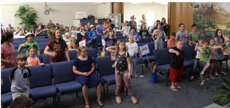
Let's get started!