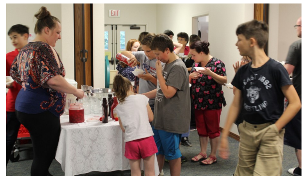
Ice cream sundaes for everyone