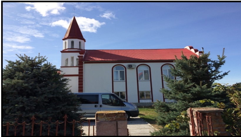
Completed church in Bohdanivka