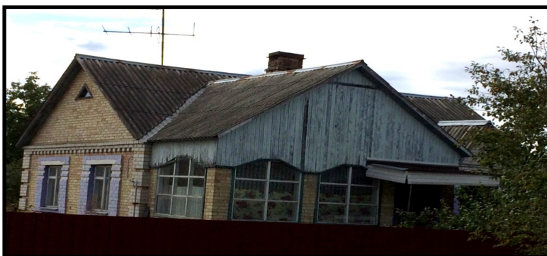
Homes in the Chernobyl Relocation Village of Zdvizhivka